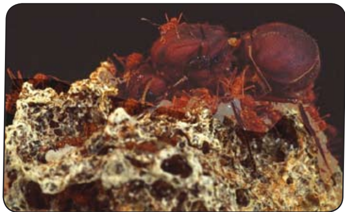
Attine ants occur in the (sub)tropical regions of America, and as far north as New Jersey on the east coast of North America. They cultivate fungi in the Leucoagaricus/Leucocoprinus clade of the mushroom family Agaricaceae. Pictured above: Atta colombica

A mere 10,000 years ago, Homo sapiens started planting and tending Acrops. This was at that time a stellar innovation, and a huge change from the gatherers’ way of life. It enabled the formation of permanent settlements, which ultimately developed into cities, and a division of labor was established. However, humans were preceded in these cultural developments by ants and termites.