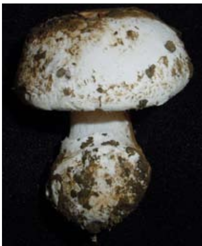
Leucoagaricus amanitoides is a free-living, non-cultivated species, which is closely related to the species that are grown for food by the ants; it grows in the UC Davis arboretum.

The main findings of enzyme assays conducted in the field, are that the leaf cutters' cultivars are good at breaking down amylose, the higher ants (leaf cutters and flower-ringing ants) have a lot of endoprotease that breaks down