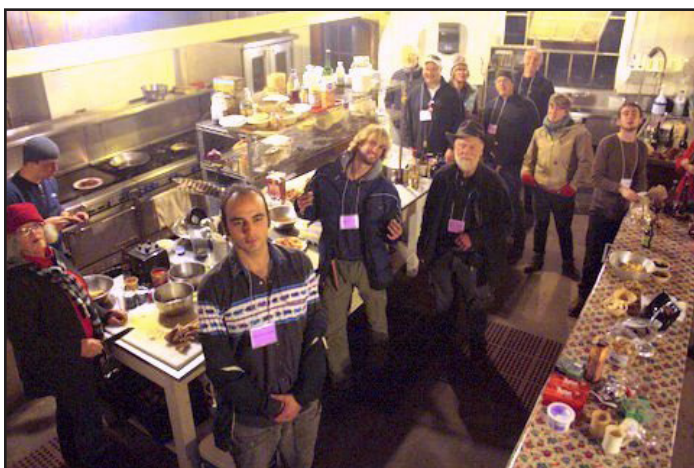
2012 Medocino Woodlands Foray: A Parting Shot Folks in the Mendocino Woodlands kitchen during MycoMendoMondo, late Saturday night, cooking into the wee hours.