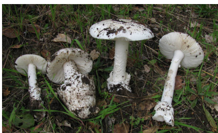
Amanita ocreata Peck under coastal live oak near Capitola, CA.