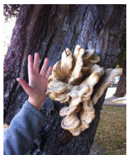
Shelf fungi that started her interest in mycology