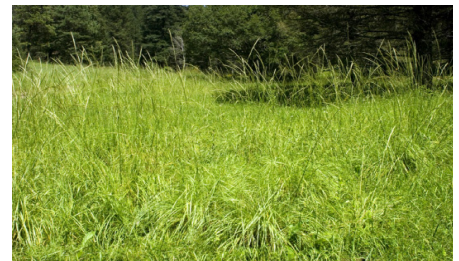
Sleepy Grass ( Stipa robusta)