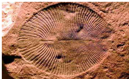
Dickinsonia sp. (Ediacara Hills, Australia)

(Reprinted from Mycena News , November 1995)