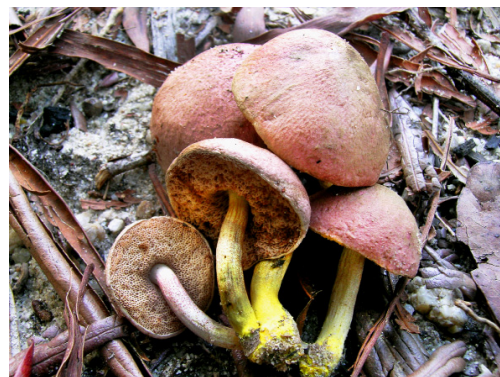
Australopilus palumanus , an Australian member of the species complex formerly known as Tylopilus chromapes .

Putting a proper name on that mushroom in your hand requires that a name exists to which your mushroom can be assigned and depends upon the process that you use in order to assign it. Your identification process – using field observations, visual examination, and possibly microscopy and taxonomic keys – is critical. However, this article will focus on the other side of the process, i.e., how mycologists determine the “correct” or “best” name for a given species.