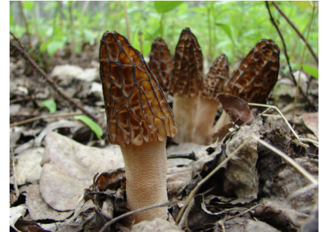
It's morel season

While there have been recent expeditions to see what is happening up in the Sierras, reports on mushroom fruiting activity are not yet available. However, I did visit the local grocer to check the availability of wild mushrooms.