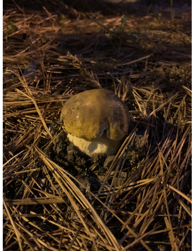
pristine little porcini