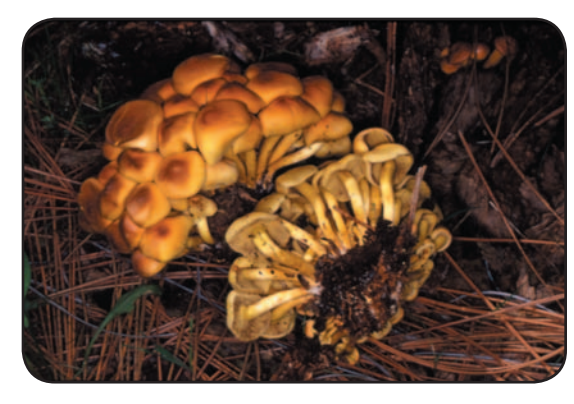
Hypholoma fasiculare, the sulphur tuft mushroom.

In fact, ectomycorrhizal species do make some of the enzymes involved in the break-down of lignin. One example is the class of enzymes known as laccases, which are secreted outside the fungal cell. But, laccases have other functions too, so their presence does not by itself prove that the species is able to break down lignin. A second class of enzymes, lignin peroxydases, is, as far as