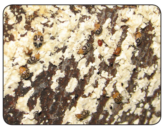
solely on assimilative abilities gus. The largest beetle (Iphiclus conspicillatus), is a comof the unknown strain to mon resupinate feeder. Barro Colorado Island, Panama.

Prior to the molecular age, yeast identification relied Various mycophilic beetles feasting on a resupinate fun-