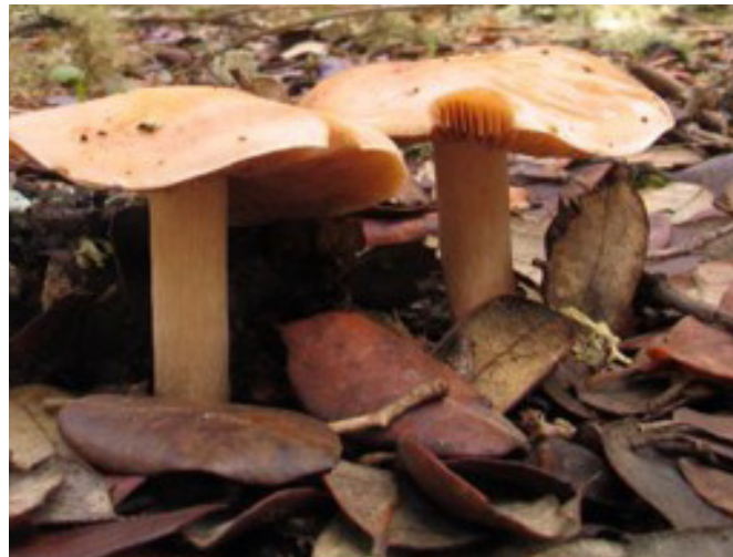
Hebeloma cf. sinapizans growing in a serpentine Quercus ilex subsp. ballota forest in Braganca, Portugal.