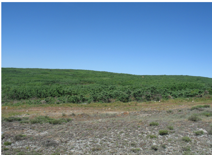
Sharp transition between serpentine (bottom) and non-serpentine soil (top) in Braganca, Portugal.

and limits. Are they resilient and able to withstand inhospitable environmental conditions? Are there any species that are locally adapted to specific unusual environments? Although the poles and deep sea are obvious extreme environments, one does not need to go far to find challenging habitats that can help shed some light on the subject. Serpentine soils are rich in magnesium and low in calcium (something that affects plant growth and health) and have high levels of heavy metals such as nickel, chromium, and cadmium, elements known to be toxic. These soils derive from rocks deep in the mantle of the planet and provide a particular chemical environment very different from 'normal' non-serpentine soils. They also tend to be shallow, rocky, and very dry. Serpentine soils are widespread across the globe comprising around 1% of the terrestrial surface, and very common throughout California, so much so that serpentine is the state rock! Serpentine outcrops tend to be small and patchy, occurring immersed in a matrix of 'normal' soil in the landscape making them a particularly interesting study system. These are widespread across the state and can be found in the Bay Area, namely in Mt Tam and along the Lucas Valley Road.