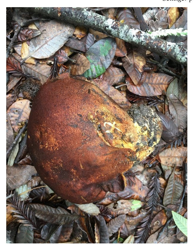
Pleurotus ostreatus, Oyster Mushroom Scutiger pes-caprae