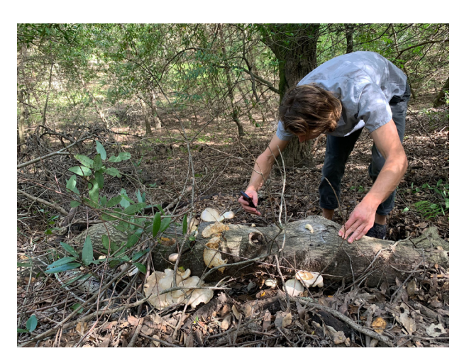
Above: Oyster log on last day of March instead of November

Right: ridgetop fire road with pig rototilling in the adjacent chaparral