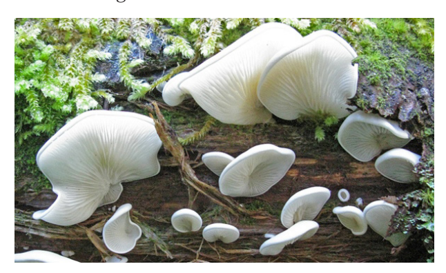
"Pleurocybella porrigens— Angels Wings"

I previously thought that this entire genera of mushrooms was edible and harmless to the beginner. Little did I know at the time that there are in fact potentially poisonous lookalikes. For instance, Pleurocybella porrigens or 'Angels Wings' is a very similar looking mushroom replete with decurrent gills; however, the key features to look for are its white color and that it grows on dead wood.