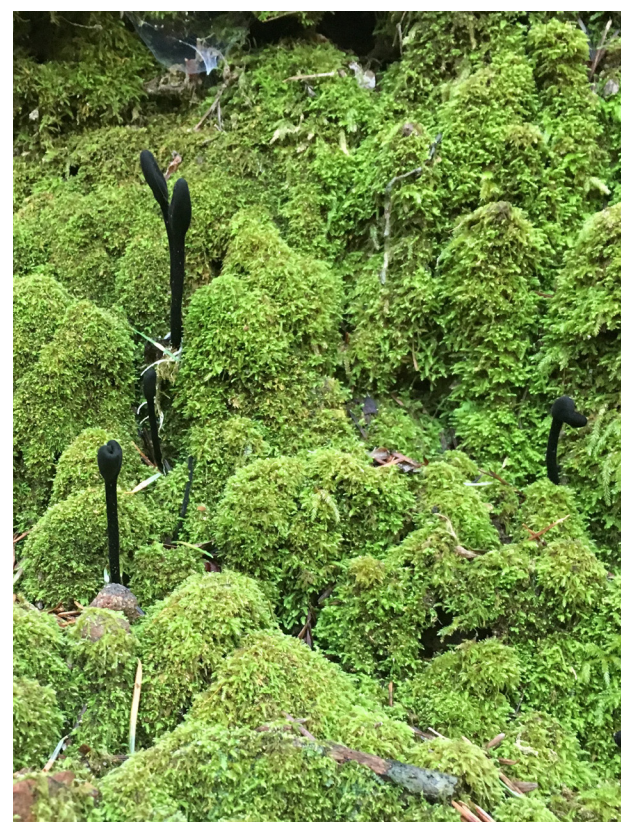
Trichoglossum hirsutum, Black Earth Tongue Helvella dryophila, Elfin Saddle