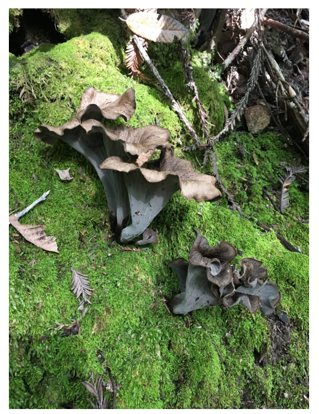
Craterellus calicornucopioides, Black Trumpet Helvella crispa?