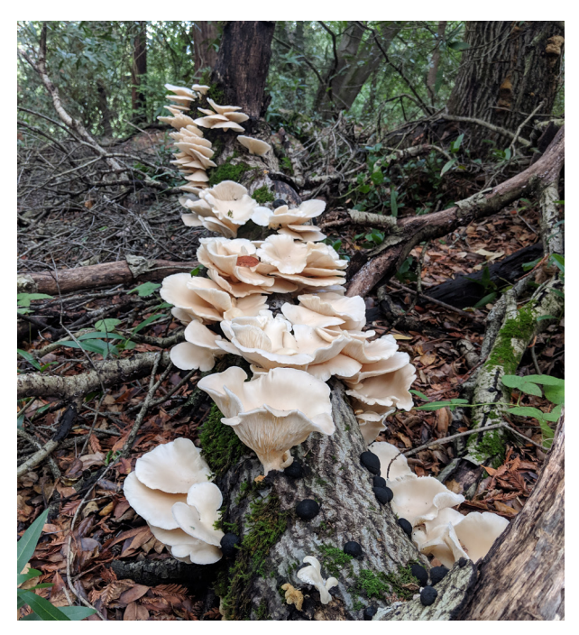
"Pleurotus ostreatus – Oyster Mushrooms"

In reading about peoples differing experiences with adverse reactions to eating wild mushrooms, there are many accounts of some people being able to eat a certain species that others find upsetting; or of an 'accomplished' fungiphile poisoning themselves over a species they have eaten safely in the past. I am not immune to this type of scenario. My firsthand account involves the innocuous and sometimes ubiquitous oyster mushroom, Pleurotus ostreatus .