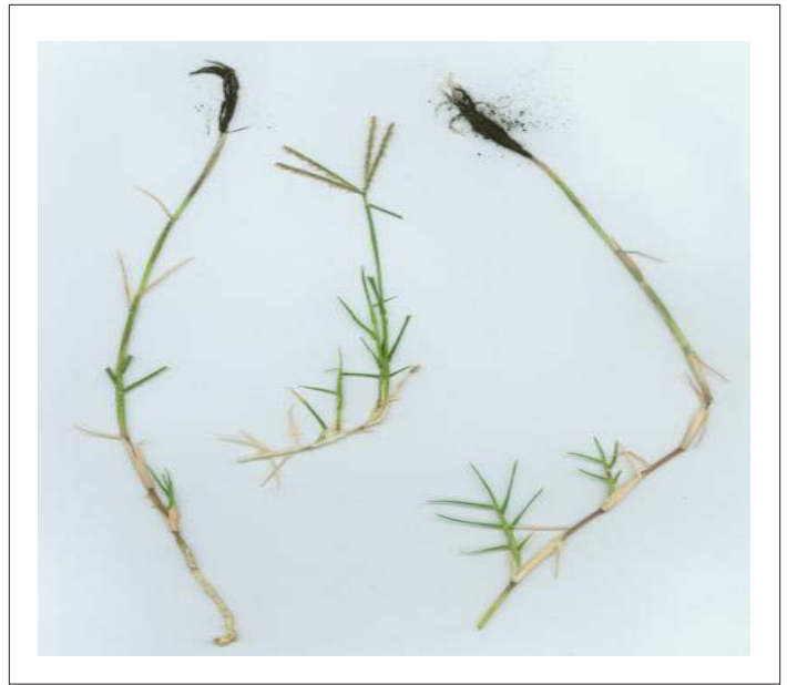
Figure: Ustilago cynodontis on Bermuda grass ( Cynodon dactylon )

Of course, other smuts do parts of this cycle in different ways. But, for most species the life cycle is not known in such detail as it is for the economically important Corn smut. Some species infect seeds, some grow throughout the plant and persist in it for the whole lifetime of the plant. As one example, take Microbotryum violaceum , which is a very interesting anther smut, specializing on carnation-like plants in the family Caryophyllaceae. Species in this family are often dioecious, which means that there are plants exclusively with female flowers and plants with male flowers. The anther smut only occurs on the male flowers and subverts the flowers to produce dark purple spores instead of pollen. This strategy should mean only a 50 % infection rate (only half of the plants are male), but, the smut has found a way to do better. It attacks