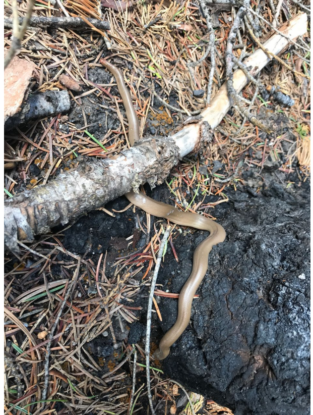
Above: There were several snake sightings Below: Cold Sleeping