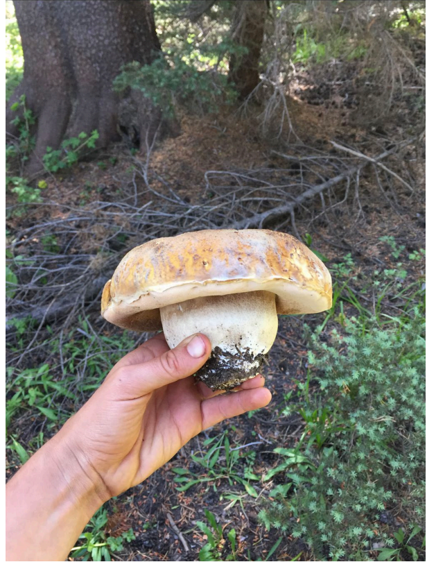
Porcini Boletus rex-veris