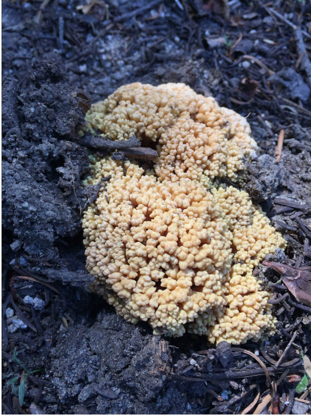
Yellow Coral Ramaria rasilispora