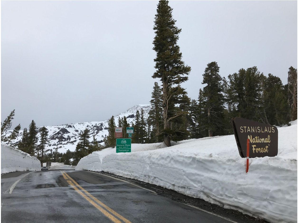
Snow at the Pass