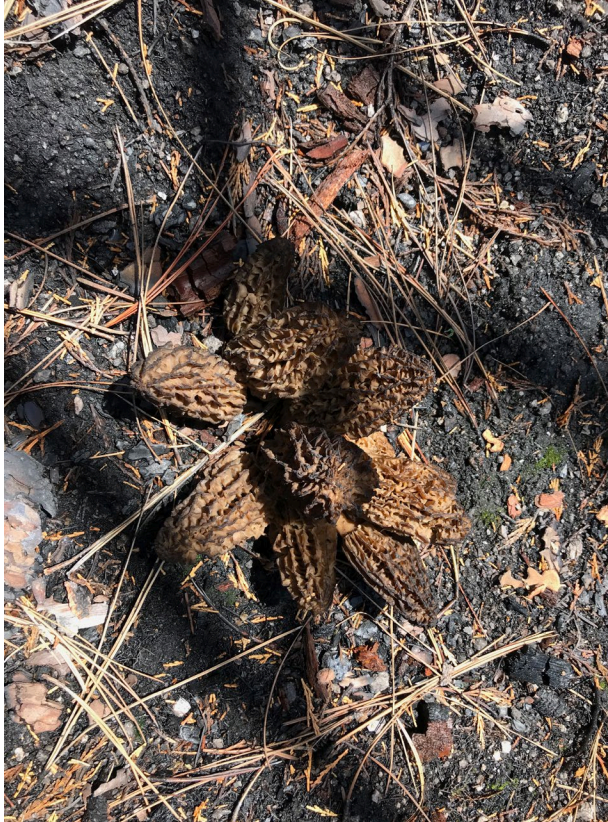
Above: Each of these was about 8 inches tall Below: Enrique with the biggest morel I've ever seen