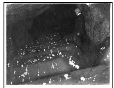
Fig. 2. Mushroom mine in Scotland (late 19th / early 20th century; It's uncertain how the pictured mushrooms growing in mines were lit; possibly by candlelight).

Island tried their luck at growing this new unknown crop in caves and cellars. In 1891, William Falconer published the first book on mushroom cultivation entitled Mushrooms: How to Grow Them; A Practical Treatise on Mushroom Culture for Profit and Pleasure (available at http://cdl.library.cornell.edu/cgi-bin/chla/chlacgi?notisid=AAM1556). Falconer suggested that mushroom growing was perfect for florists; since they