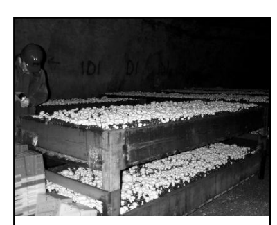
Fig. 3. Button mushrooms growing in limestone caves at Moonlight Mushrooms farm.

types, including other Lentinula, Flammulina, Pleurotus, Hypsizygus, Hericium, Morchella, and Grifola. Today, Pennsylvania leads the country in total annual production (>50%), with California a strong second. More than 20 other states now add significantly to total production. This means that mushrooms, which have limited shelf life and shipping range, are available everywhere!