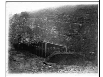
Fig. 1. Entrance to mushroom mine in Scotland (late 19th / early 20th century).

fertilized with horse manure, and later confirmed that horse dung was closely associated with growth of the button mushroom. In 1630, the first attempt at indoor Agaricus cultivation occurred near Paris in Chambry, France in caves (limestone quarries) where they produced "champignons de Paris". Some accounts report that King Louis XIV (1643-1715) was among the original European mushroom growers. It wasn't until the 19th century that modern cultivation techniques were formed and then passed onto gardeners in England. Agaricus cultivation in caves spread quickly throughout Europe, reaching Belgium, Holland and Scotland (Fig. 1 and 2).