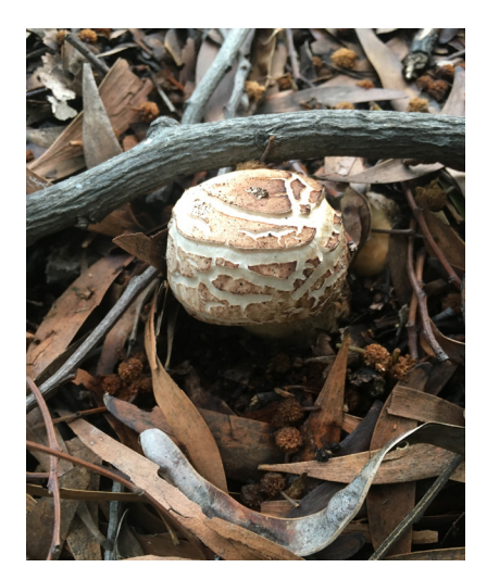
Shaggy Parasol - Oakland, CA