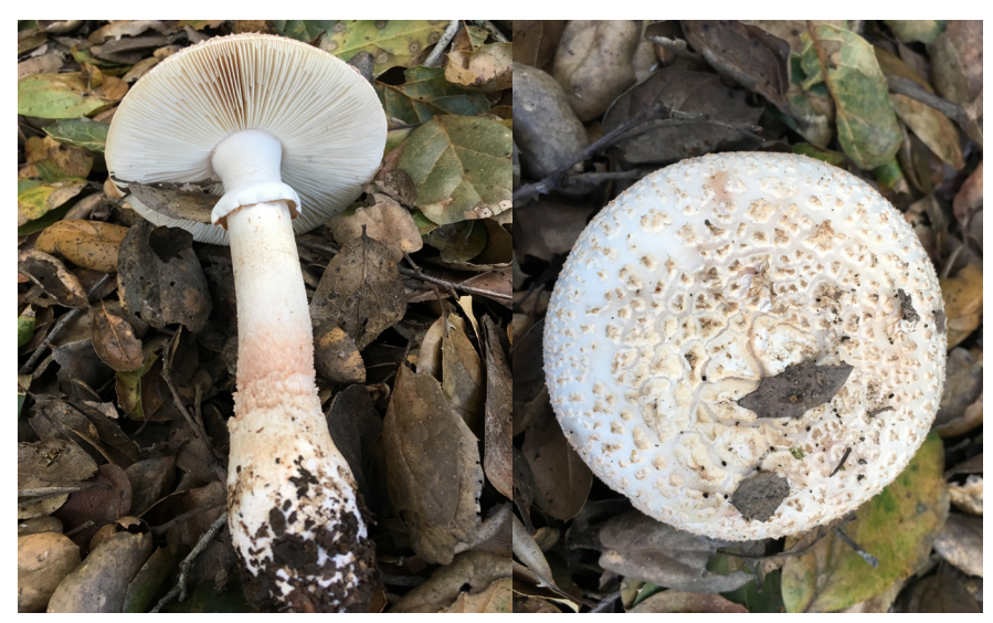
Amanita novinupta - Oakland, CA