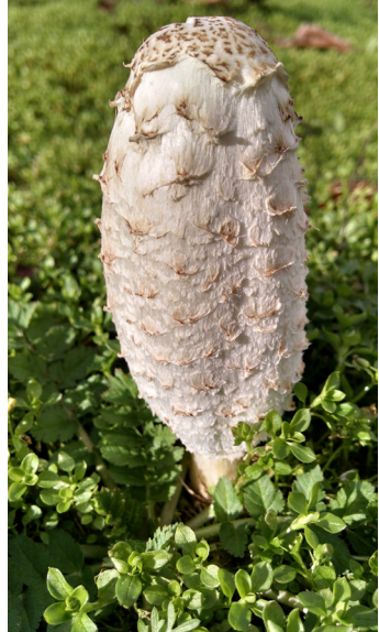
Shaggy Mane from Alameda College

Button mushrooms and shaggies constitute a lifestyle group of compost feeding saprobic mushrooms that are helpful to learn about as a group. When we say buttons, that's the vulgate name that refers specifically to the members of the taxonomic genus Agaricus . The Agaricus genus encompasses the portobello, crimini, and button mushrooms typically found in the generic produce section of most common grocery stores; it's the mushroom that the average American thinks of when they think of mushrooms as food. The genus is generally divided into the edible half of species that have an anisey-almondy or store bought but-