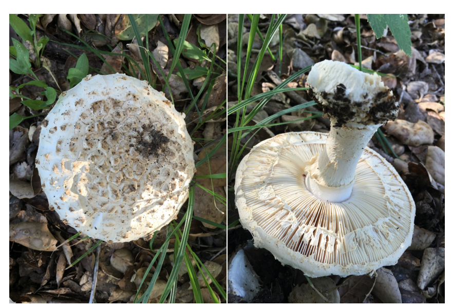
Amanita Subgenus Lepidella - Oakland, CA