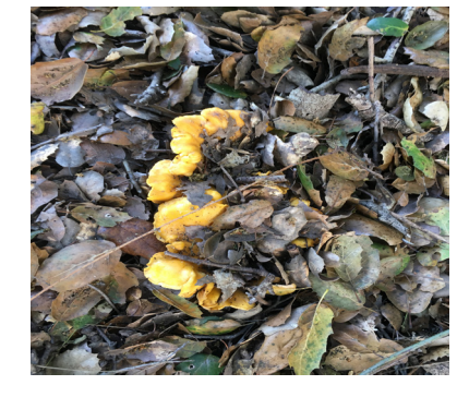
Cantharellus californicus - Oakland, CA