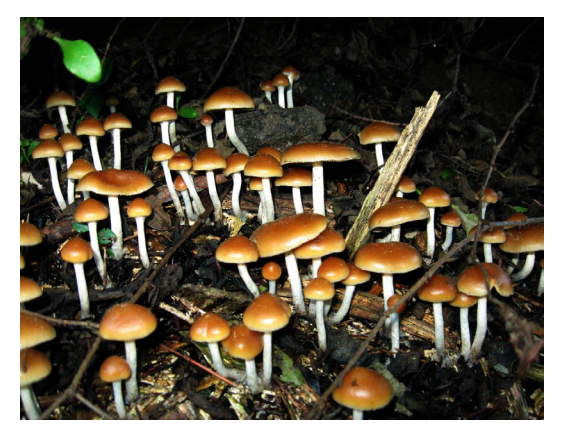
Psilocybe allenii