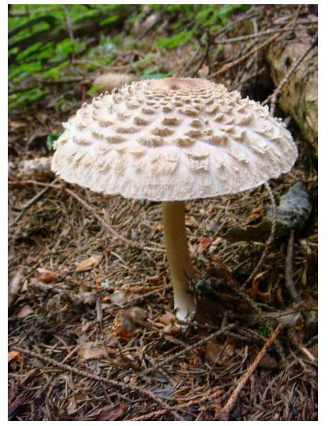
Shaggy Parasol from a Norway trip

and then El Niño went off to play elsewhere, leaving us with the balmy tropics -- not bad if you're into cacti and succulents. Early fruiters that usually come out with the first rains were finally showing up in late January and early February. I know a reliable Jack O' Lantern that fruited consistently for the last ten years from Thanksgiving through Fungus Fair at the base of a lightning bolted oak. It was just wilting at the beginning of February. Nearby is an oak with a