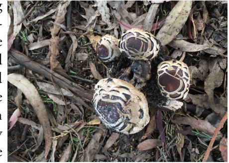
Shaggy Parasol

begins to turn black at the bottom edge of the pink portion, so in the early stages you can see that the gills are still white at the top of the cap, there is a band of pink gills toward the middle, and the bottom edge of the pink band has turned black. Any part of the cap that has turned pink or black will taste "funky" but any remaining white flesh of the cap can be cut away from the pink stuff and cooked for eating.