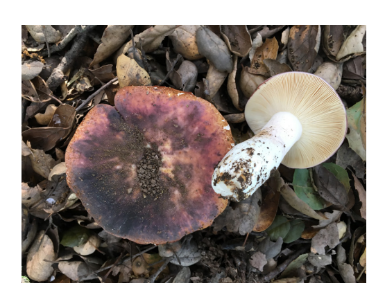
Russula - Oakland, CA