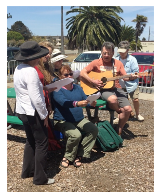
MSSF Picnic 2015

Verse #2 Blue Moon, I know you're not Houdini, But please don't be a meanie, JUST SHOW ME SOME PORCINI!