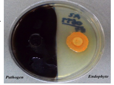
Endophyte-pathogen interactions

The recent advancements in endophyte research have uncovered a surplus of biochemical richness, yielding new compounds and pharmaceutically or industrially important metabolites. The Arnold lab is currently collaborating on four projects with focus on the natural chemistry of bioactive fungi in deserts, diverse temperate and boreal environments, and tropical forests. Through this work they are evaluating ecological distributions of endophytes and other fungal associated plants parts, such as cactus spines and tree thorns. This work aims to uncover metabolites that can be applied to breast cancer, prostate cancer, antibiotic-resistant bacteria, and the causal agents of malaria, leishmaniasis, and Chagas' disease.