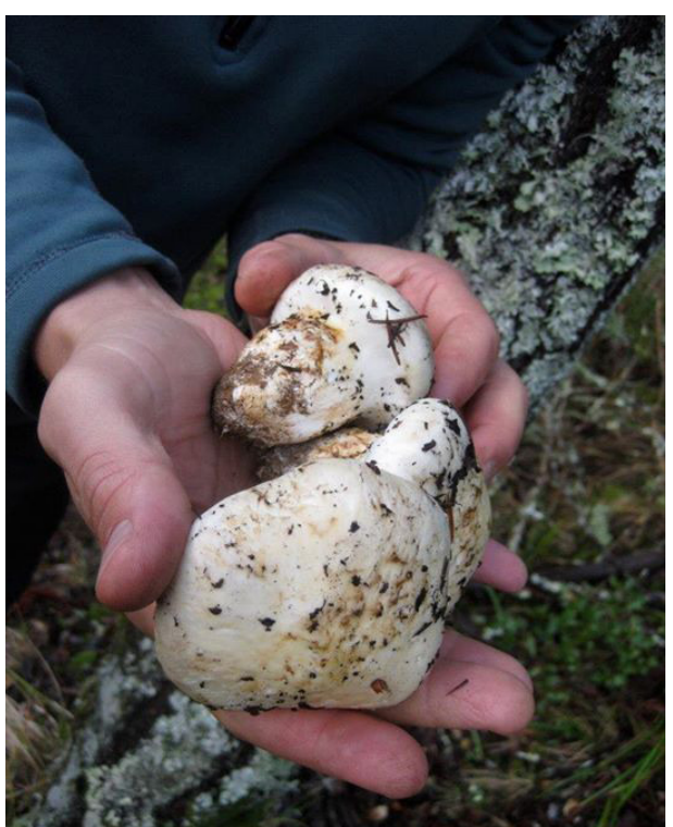
Perfect #1 button Matsutake M.Evans

MATSUTAKE, OR Tricholoma magnivelare, literally translated as 'Pine Mushroom' in Japanese (Take means mushroom and Matsu means pine) is the common name for a highly sought after choice edible that grows in Asia, Europe, and North America. It is prized in Japanese, Korean, and Chinese cuisine for its unique spicy-aromatic odor. In fact the taste has been described as 'indistinct' and the texture as 'chewy & tough' in various guidebooks. Not exactly the type of adjectives you expect associated with one of the most sought after mushrooms locally and around the globe. So why would a fungiphile bother with a species so mundanely described? It all goes back to that