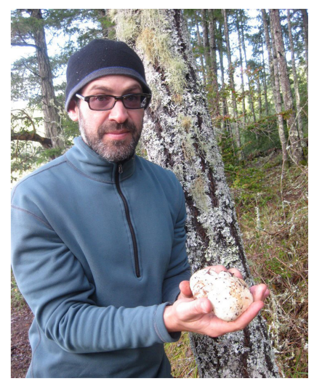
Matsutake found on Mt. Tamalpais at the base of a Douglas-Fir tree. M. Evans

Matsutake mushrooms grow at the base of trees and are usually concealed under leaf litter on the forest floor, forming a symbiotic relationship with roots of various tree species. Obviously, they do like pine trees but in our coastal areas they also associate with Tanoak/Madrone forests, having a liking for sandy soil. When foraging for this mushroom, do not mistake this for an Amanita species. Let your