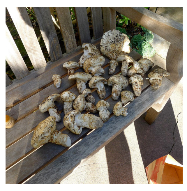
Epic harvest of Matsutake from San Mateo County M. Evans

nose be your guide but also look for distinct features such as the thick cotton-like veil and rubbery flesh. When in doubt, consult.