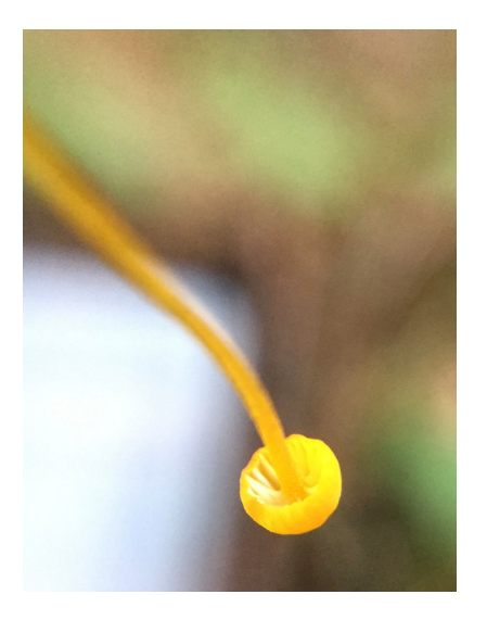
Agaricus deardorffensis, Gymnopus dryophilus, Mycena oregonensis

Next page: Leucoagaricus flammeotinctus, Mycena californiensis