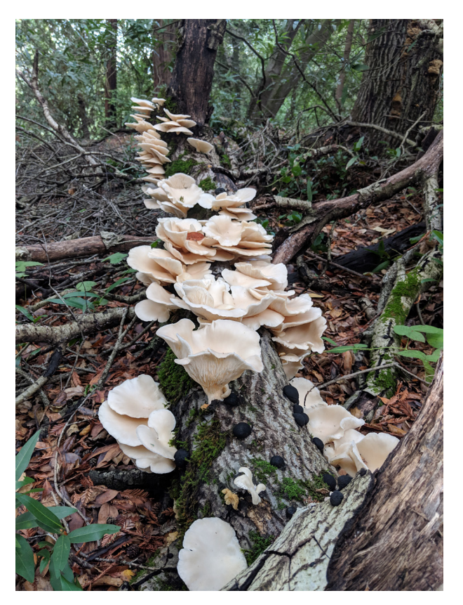
Pleurotus sp. found in Redwood Regional Park I. Peterson

are described as 'overlapping tongue-like clusters' with an in-rolled margin when young. The stalk, which is often attached off center of the cap, helps when ID-ing this species. When foraging for this species, one thing to keep in mind is the fact that these mushrooms favor cooler weather. These recent rains and the cooler temps make for the perfect environment. They do degrade quickly so it is best to prepare them within a few days of finding them. They are best grilled or fried as showcased in this months recipe: