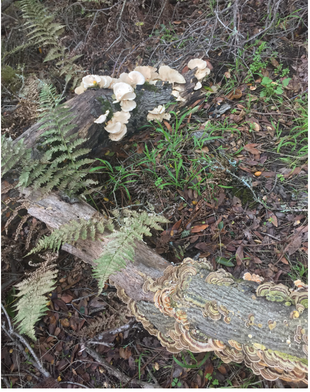
Pleurotus ostreatus/Oyster and Trametes versicolor/ Turkey Tail Omphalotus olivascens/ Western Jack O'Lantern