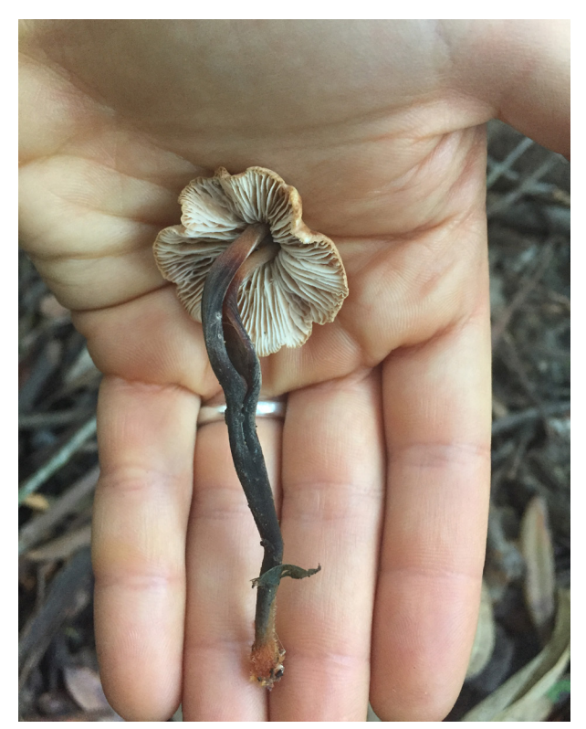
Gymnopus brassicolens/ Stinking Gymnopus Lactarius rubidus/ Candy Cap