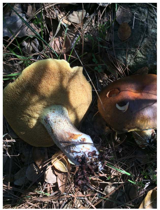
Suillus pungens/ Pungent Slippery Jack Laccaria amethysteo-occidentalis/ Western Amethyst Deceiver