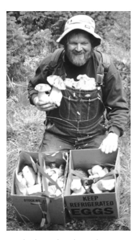
Our prez with advanced mushroom-hunting equipment on an undisclosed mountain slope full of boletes.